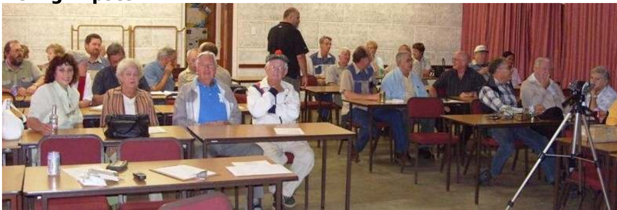
Above: most of the attendance